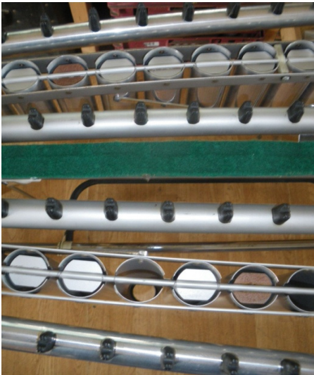
Difficult to see in the picture, but there is corrosion on the damper bar

There are two butterflies on the resonators that have been replaced, but not painted, so they have gone rusty.